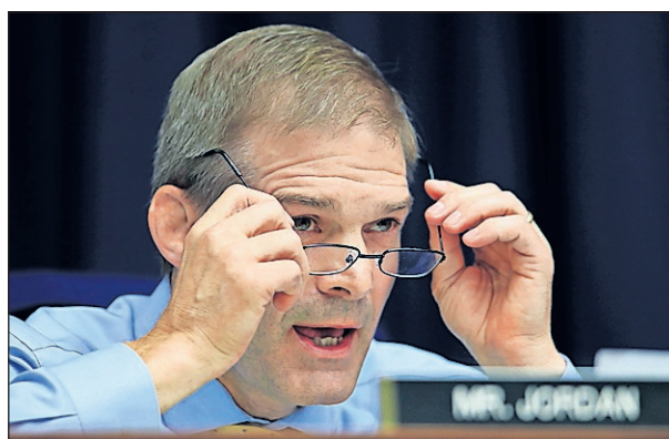
Rep. Jim Jordan of Ohio questions witness FBI Deputy Assistant Director Peter Strzok on Thursday.

When Jordan floated himself as a candidate for House speaker, his allies cited his history on the wrestling mat as a reason for how tough and serious he would take the race. "If Congressman Jordan decides to run, just like he did when he was a